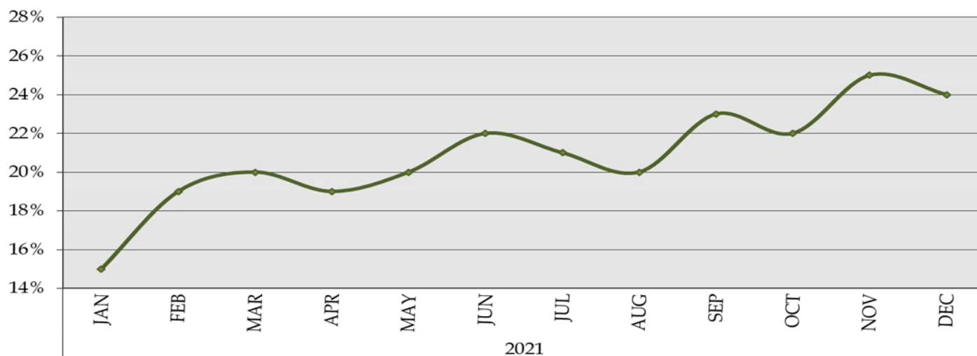
Estimated Finished Steel Import Market Share for the Past 12 Months